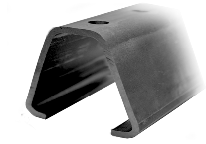
Manufactured with High Strength Low Alloy Steel